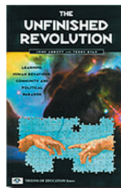
(2000, UK edition) Network Education Press 21learn.org